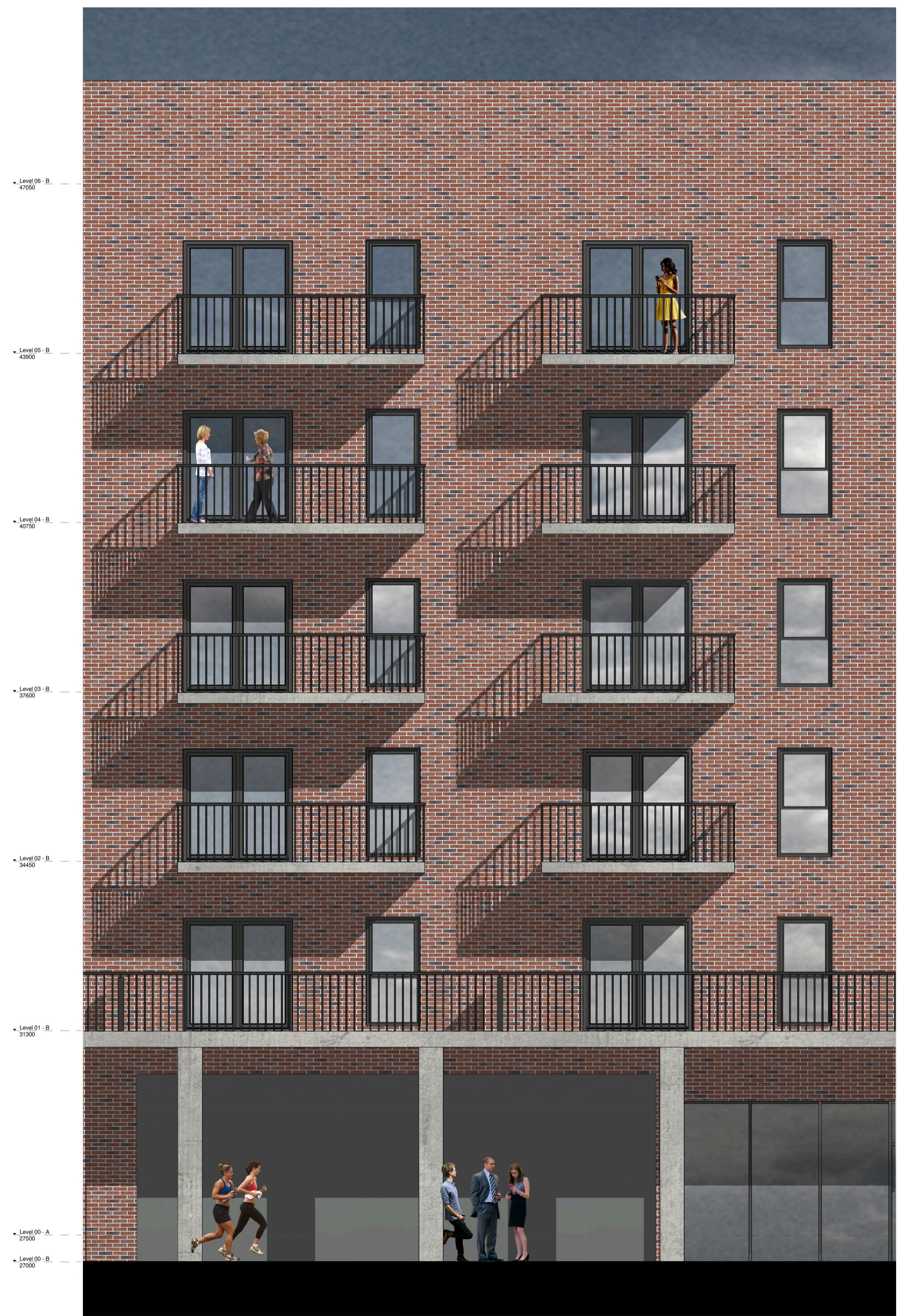
1 Block E Elevation Study 1:50